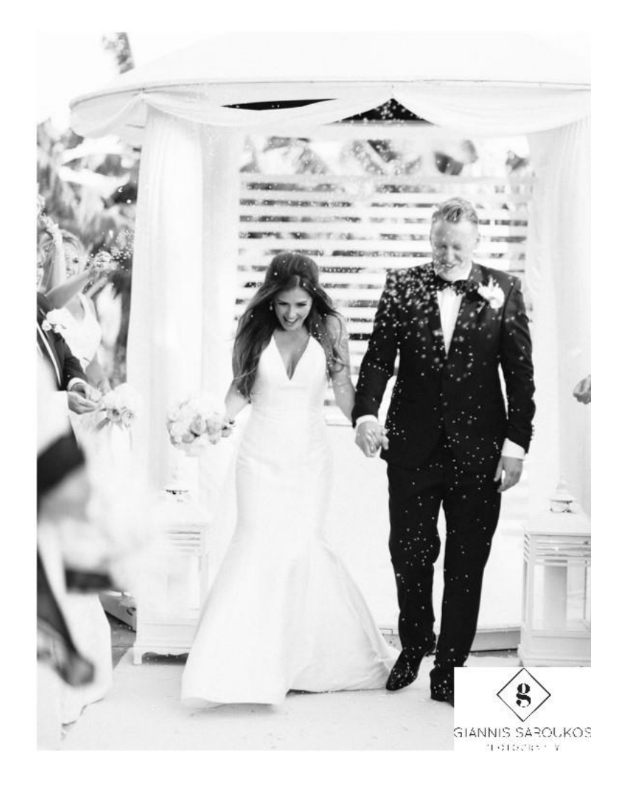
BEACH CEREMONY ( cost 620 €)